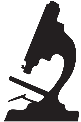
Photo of actual plaque germs